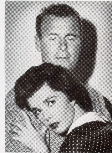
"APPOINTMENT WITH A SHADOW" (1-A)

No newcomer to the suspense drama after his roles in "Flood Tide" and "Man Afraid," Nader turns in an exceptional perform-